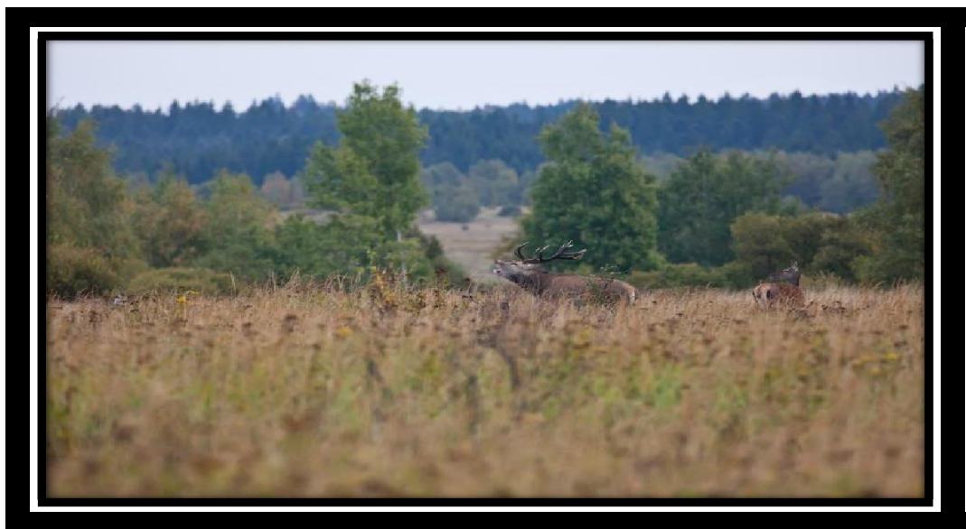
A Red Stag During Breeding Season