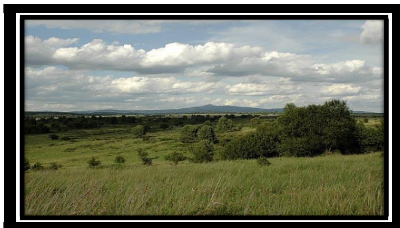
A view of hunting area